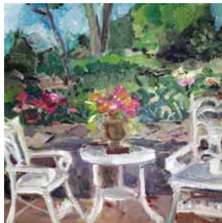
Above: Untitled garden painting. Oil on canvas. 12" x 12" painted in 2011.