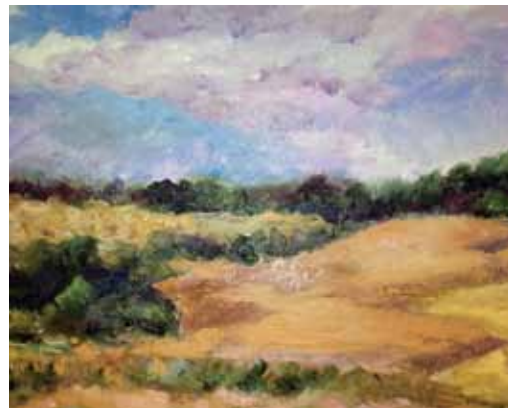
Above: "Unison Fields," oil on wood. 13" x 14". One of two paintings Barbara is donating to the Heritage Day auction. Barbara Sharp photo.