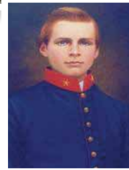
Right: A painting of Major John Pelham, the legendary leader of Stuart's Horse Artillery.