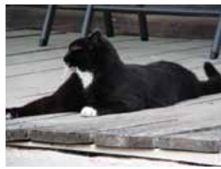
Mosby loves all this activity in his village.