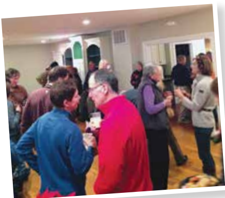
Christmas "Jingle Jam" and Cookie Swap.