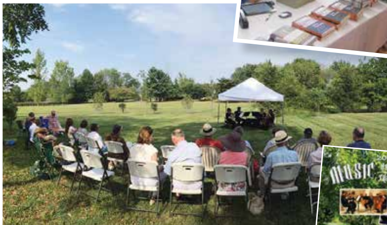
Music on the Village Green.